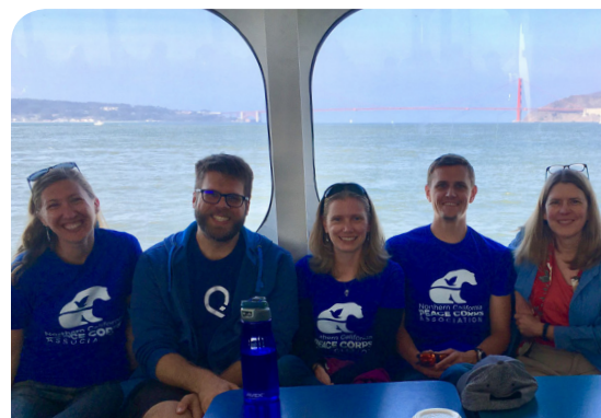
Come join us at the summer picnic in the Marin Headlands and help assemble the care packages for California PCVs!